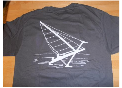
back of shirt

WSSA Website: www.iceboat.org/regattas/wssa/