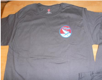
front of shirt

WSSA long sleeve t-shirts, $25.00 each plus shipping. Choice of three colors – charcoal, medium blue, and forest green. Sizes in stock are medium, large, XL, and 2XL. A colored WSSA logo is on the left side of chest, a stern steerer in a tall hike (thanks to Jeff Seeboth for the pose) is on the back. Send t-shirt orders to WSSA Secretary/Treasurer.